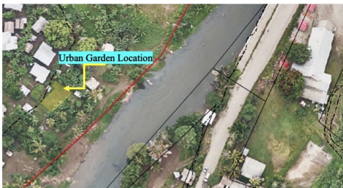
Location of urban garden on riverbank

Locally named the 'Sup Sup Garden' the pilot urban garden was located on the upper reaches of the riverbank floodplain in Central Valley, but not in an immediate flood danger zone. Several previous options had been put forward by the community for consideration but were located on private property or were inaccessible due to tightly surrounding housing (making those sites a trigger for