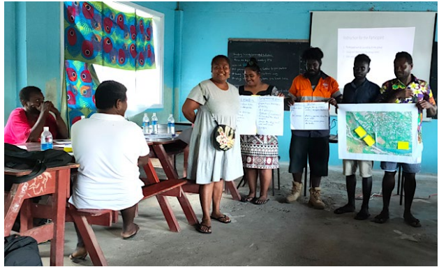
Koa Hill community members discussing riverbank protection issues