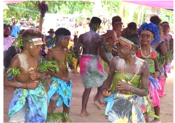
Traditional costumes, song, and dances performed by members of Koa Hill community