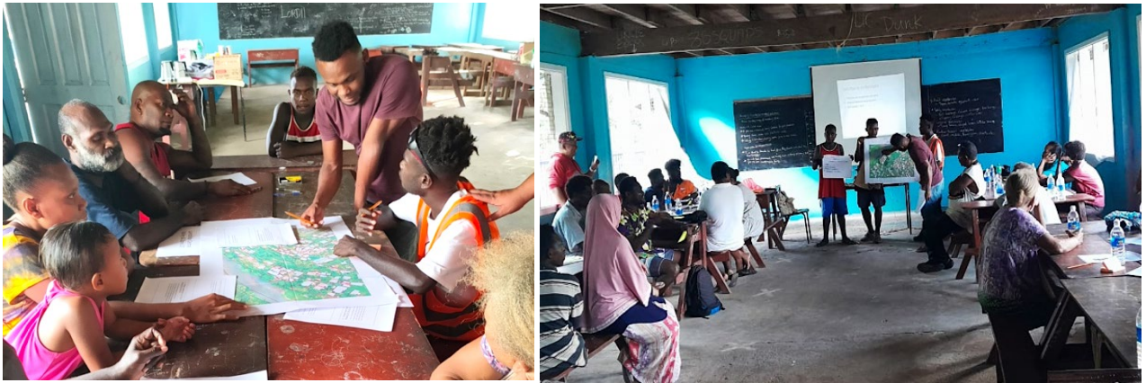
Community members discussing landslide prevention actions in Zone 27