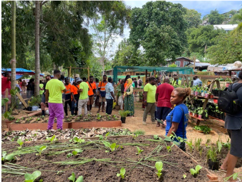
Urban garden demonstration plots