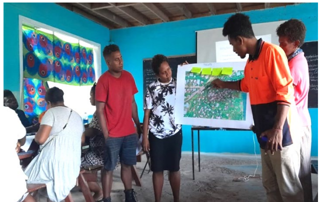
Community members discussing pilot landslide interventions

Issues discussed: Cause of landslides. Runoff from the main road comes though overflow of rainwater from the road to the residential area through the side of the road and Jacob's ladder (steep concrete stairs built for community access to the main road on the hill top).