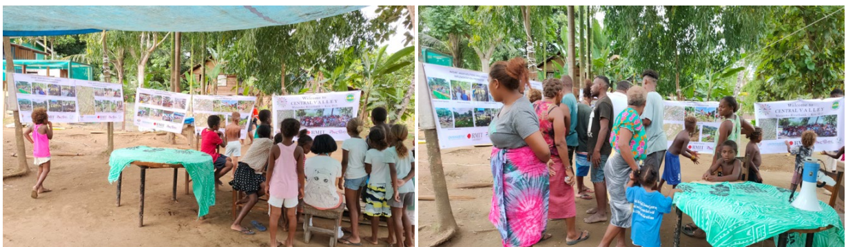
Children and adults excited to see photos of themselves on banners prepared for the exhibition