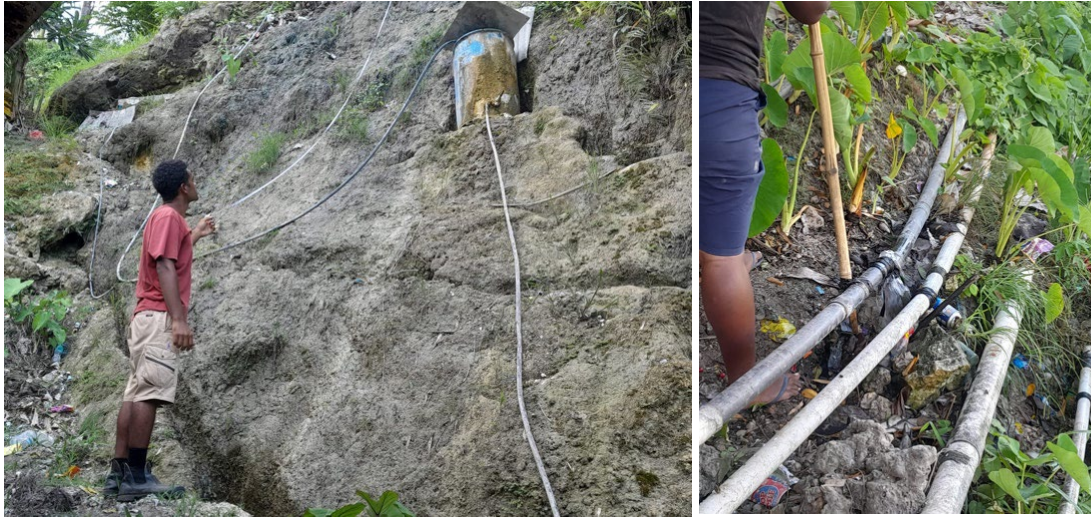
Central Valley landslide risk hotspot in Zone 27 with community-built water pipes

Other community issues include a lack of road access and safe footpaths, lower-quality housing, poor waste sanitation, and overcrowding. There is no sewerage infrastructure or rubbish collection services (a consequence of limited road access), with pit toilets constructed out of locally found materials on a per-household basis; leading to heavy pollution of the Mataniko River.