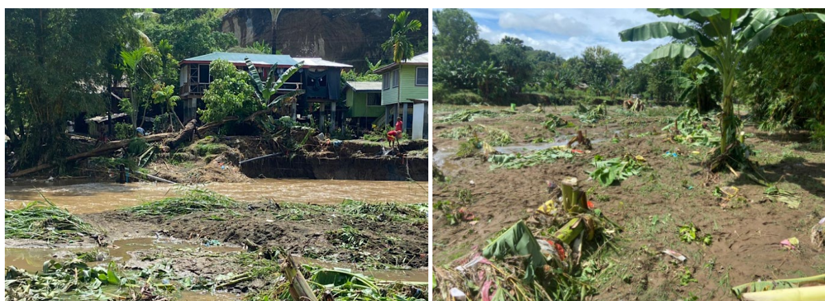
Flooding debris and damage along Mataniko riverbank (zone 27)

An unexpected event occurred during the project implementation period. Heavy rainfall on Friday 11 November caused flooding to areas along the Mataniko River. Gardens on the Central Valley riverbank sedimentation side were washed away, flood debris littered the pilot vetiver planting sites, and a landslide occurred in Zone 27 near the local church. The location for the garden pilot in Central Valley was not inundated however, being located further away from the lower floodplain.