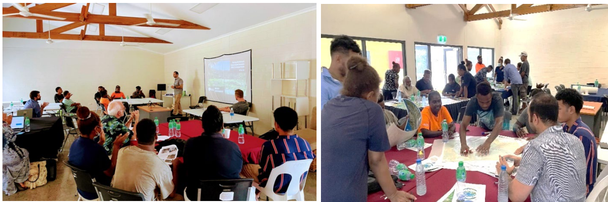
Workshop presentations and group discussions

The workshop was well-attended with a high level of engagement, resulting in new local insights and considerations to feed into adaptation planning as part of the Greater Honiara Urban Strategy.