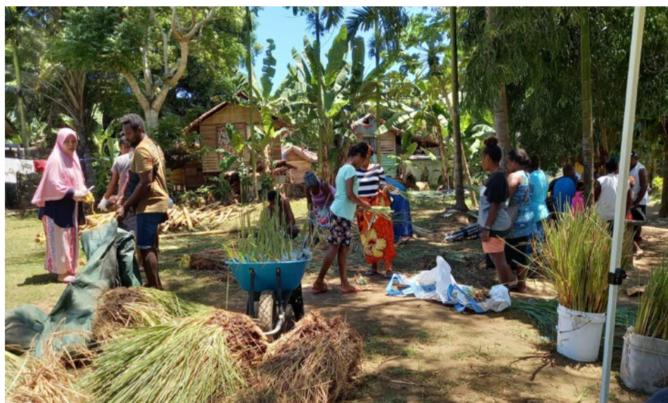
Vetiver grass propagation training workshop

A hands-on training workshop on vetiver grass and lemongrass propagation was held on 16 November (as requested by community members during the co-design workshop). The PacSol team explained the characteristics and multiple benefits of vetiver grass and lemongrass, and methods of propagation. Waste materials (plastic water bottles and cups) were recycled to use as containers, and grass was prepared for propagation. 3,500 slips of vetiver grass and 200 slips of lemongrass were produced during the training session to be used in the NbS implementation phase.