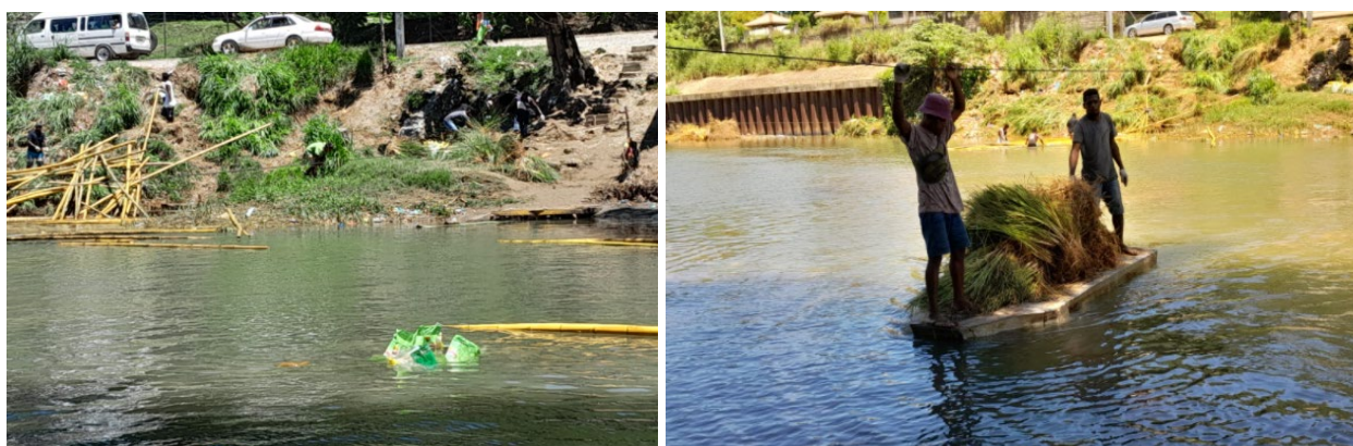
Transporting bamboo and vetiver grass across the Mataniko River on floater

The nursery house construction took 4 days including one day preparing and transporting materials across the Mataniko River on the floating platform, as well as floating bamboo down the river. This activity highlights the difficulty and inaccessibility of Koa Hill and the heightened vulnerability of the inhabitants of the settlement. A 5 x 7 m greenhouse was built for the nursery near the 'sup sup' urban garden site on the Central Valley riverbank floodplain.