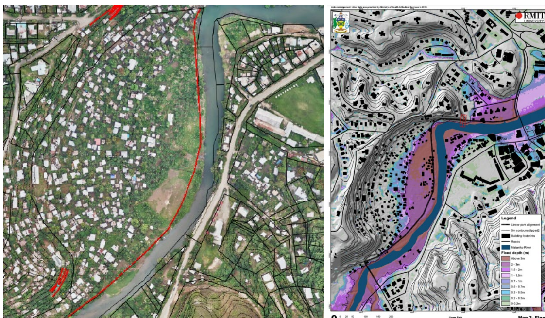
NbS flood mitigation pilot site along riverbank (l), flood risk map (r)

Flood mitigation and riverbank protection NbS actions included planting vetiver grass and bamboo along the riverbank. 1,800 slips of vetiver grass along 650 metres of riverbank were planted by Koa Hill children, women and youth. Bamboo fences were prepared by community volunteers and erected along the track marked out for the pilot NbS intervention to mark out and protect the new plantings, and bamboo that had previously been planted along the riverbank by the Anglican church youth was replaced and replanted after many were washed away by flash flooding.