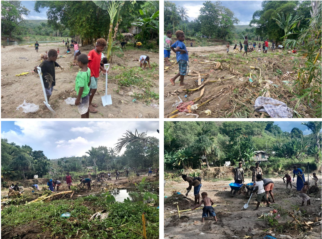
Riverbank clean-up of debris after flooding

Koa Hill community members, including children, spent considerable efforts over several days between 12-17 November cleaning up flood debris and damage on the riverbank prior to planting the vetiver and bamboo for the NbS pilot.