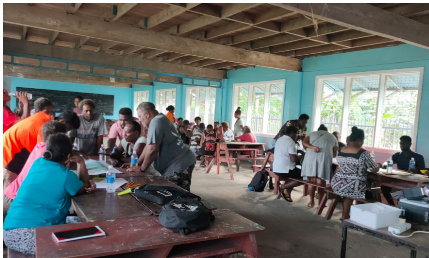
Participatory workshop held at Tuvaruhu Secondary School

Following on from the awareness-raising activities, an intensive co-design workshop with self-nominated representatives from all three communities was held on 6 November to design and validate locally appropriate NbS to pilot in the Koa Hill area. Workshop activities were informed by aerial and satellite imagery, as well as landscape designs that had been developed in student studios at RMIT during 2019-22 (School of Global, Urban and Social Studies and the School of Architecture and Urban Design). These were developed during the COVID-19 lockdowns when international travel was not possible. The input of local knowledge was actively encouraged at the workshop.