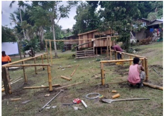
Volunteers staking out site for urban garden and constructing the nursery out of bamboo