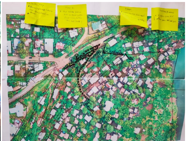
The PacSol team leader facilitating group discussions (l), aerial photos used in the community workshops (r)

Participants were divided into four break-out groups according to the NbS projects to be implemented in Koa Hill: urban garden, riverbank protection, and landslide prevention (zones 26 and 27). The groups discussed a range of social, cultural, and site issues relating to the pilot projects, as well as possible solutions for addressing various local social and environmental challenges.