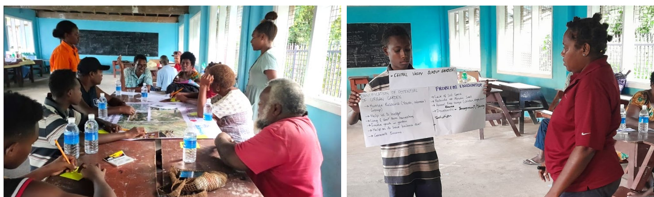
Community workshop discussions and issue identification