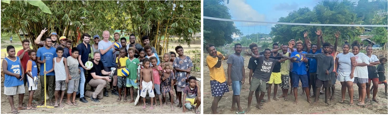
Designated public recreation areas with volleyball and futsal fields on flood prone area Visiting RMIT team gifted sports equipment to community youth