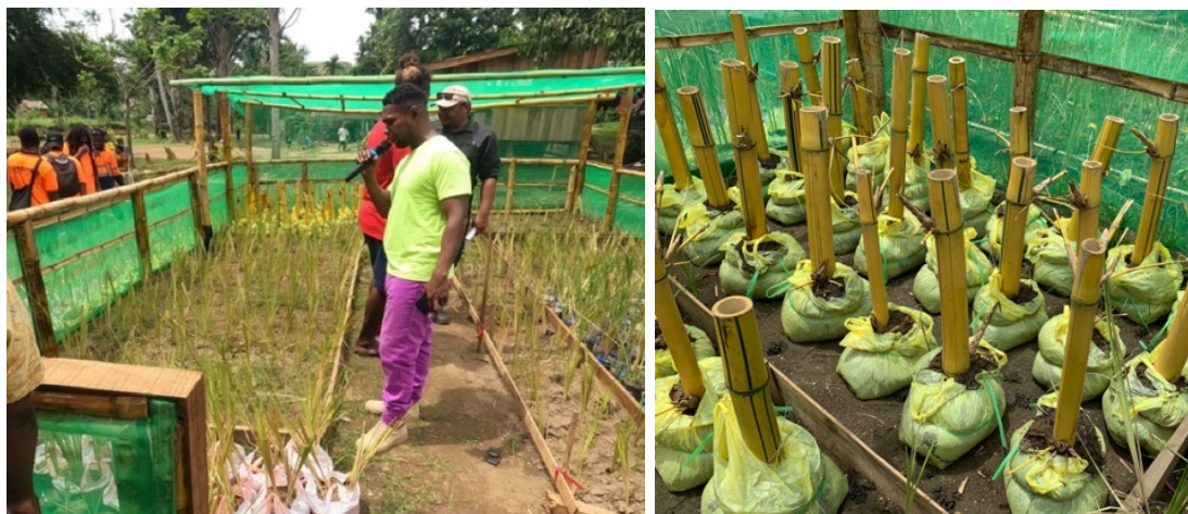
Vetiver nursery next to urban garden with vetiver, bamboo, and lemongrass propagation