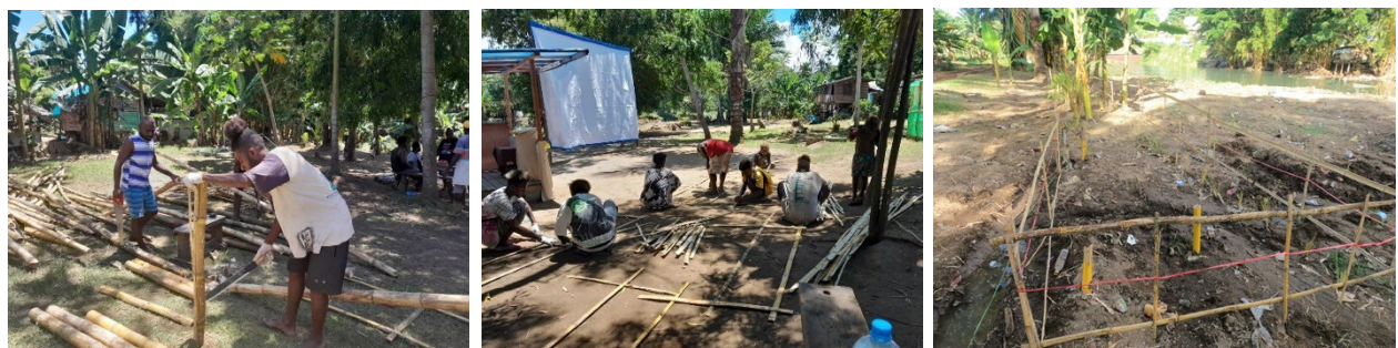
Bamboo fencing constructed to help protect vetiver grass and young bamboo along riverbanks

150 modules of bamboo fencing were made by the community to protect vetiver grass planted along the riverbank to assist with flood mitigation.