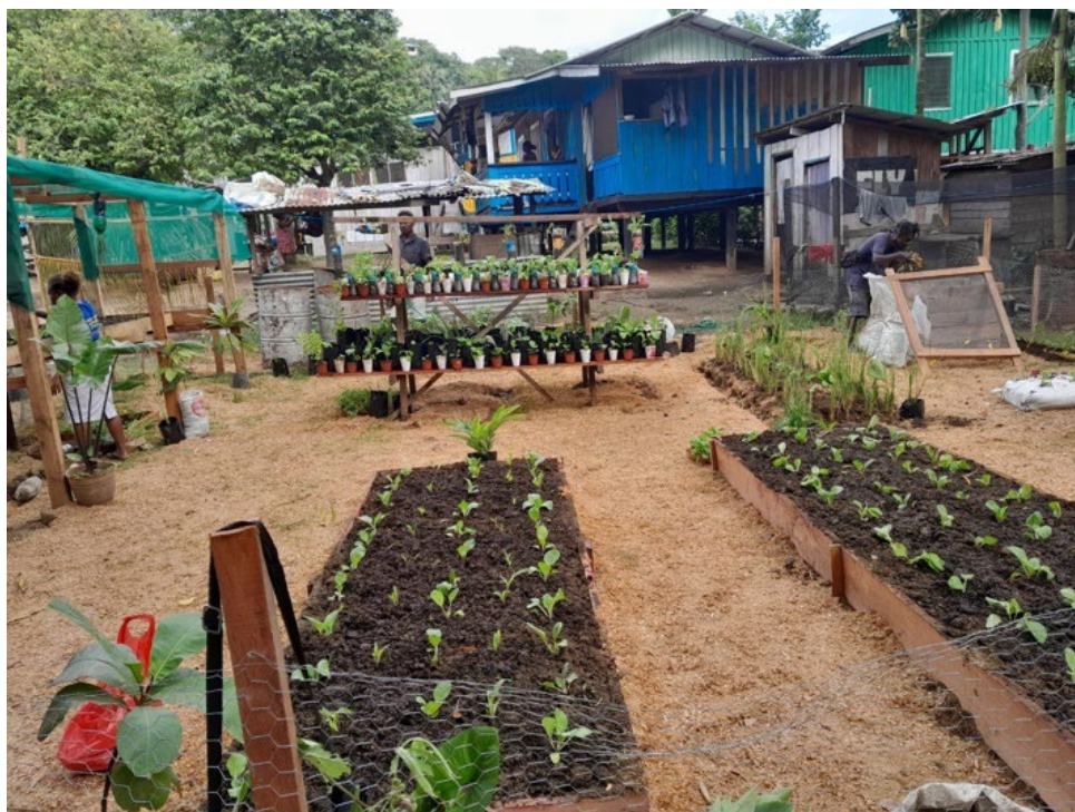
Completed urban garden with raised beds

The site was approximately 146m 2 with a seating area integrated into the design. The nursery greenhouse for NbS plant cultivation was co-located with the urban garden, creating an integrated public space.