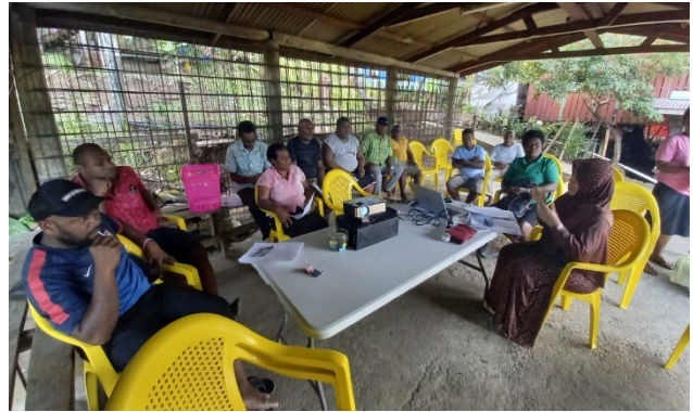
Community consultation meetings with CDCs in Zone 26 and 27, Koa Hill

On-site face-to-face meetings between the local project team and community members representing women, youth, elders and the disabled were critical in ensuring community buy-in; thus enabling successful project implementation and sustainability. During initial site visits the project team also became aware that the Central Valley (riverbank) community, though not included in the formally recognised Koa Hill CDCs in Zones 26 and 27, had its own Chairperson and representative committee. Their commitment to the project proved critical, as the flat land around the Mataniko River floodplain fell under the ownership of the Central Valley Community and was identified as the preferred site for the urban garden pilot.