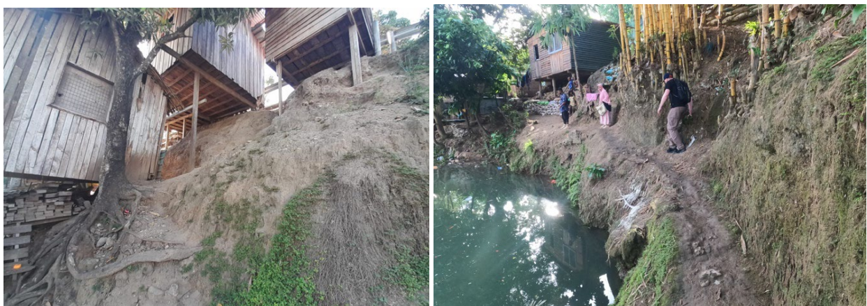
Houses built on steep slopes in zone 26 and inaccessible pathways in zone 27

The upper parts of the settlement are at risk from landslips following heavy rainfall, while dwellings on the floodplain or near the riverbanks are at severe risk of riverine and flash flooding from the Mataniko River. Indeed, Koa Hill was one of the key vulnerability hotspots identified in the 2014 UN-Habitat Honiara Vulnerability & Adaptation Assessment (VAA). Shortly after the VAA was released, the Koa Hill area was severely impacted by a record-breaking extreme rainfall event (April 2014). The floods resulted in 22 fatalities and the destruction of an estimated 675 houses, with a total damage and loss bill estimated to be more than US$100 million.