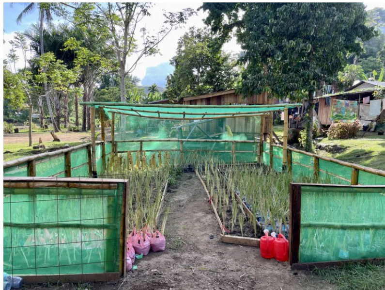
Nursery house for plant propagation