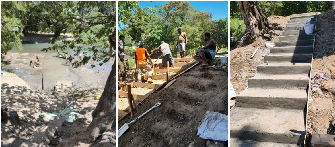
Steps and jetty before construction (left). Stairway construction (middle and right)

Access to the Koa Hill community was greatly improved by the construction of a concrete stairway 6 metres in length and 2 metres wide from the main road in the Kunsao area to the main 'floater' ferry crossing.