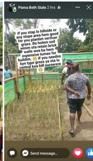
Community exhibition and showcasing of NbS pilots