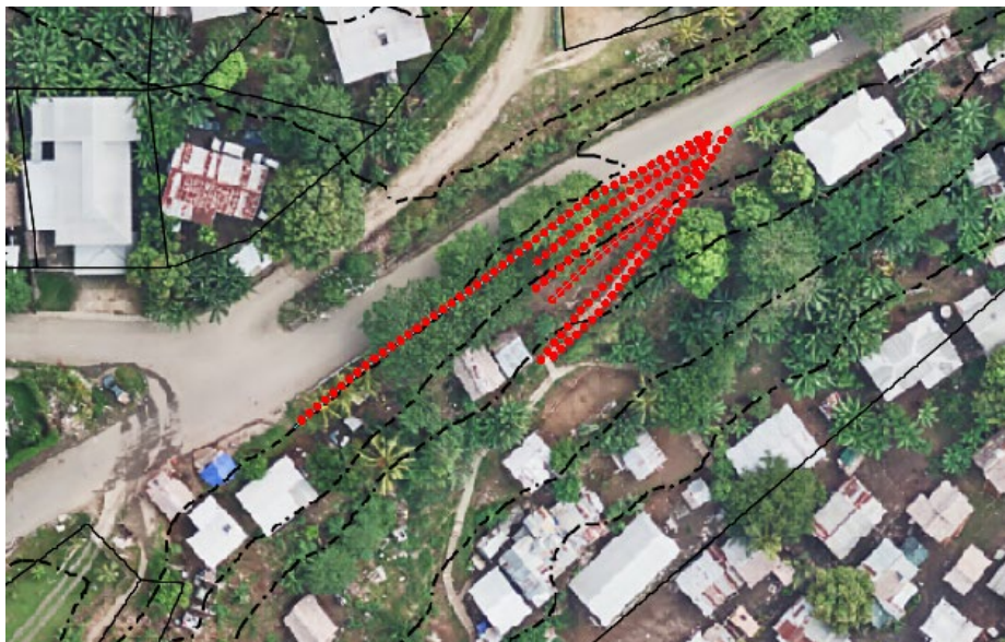
NbS pilot site for landslide prevention at the top of Koa Hill Zone 26

Vetiver grass was planted at the top of Koa Hill Zone 26 in a pattern designed to channel water runoff from the road that is causing soil saturation and slope destabilisation. The slopes above the concrete stairway (Jacob's Ladder) leading to the main road to Honiara CBD was cleared prior to planting 180 metres (400 slips) of vetiver grass, led by SINU students and the PacSol team.