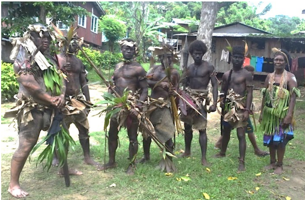
The project's 'welcoming' committee

This was a significant milestone event for the Koa Hill settlement, who publicly expressed their gratitude to SIDA, UN-Habitat, RMIT, PacSol and project partners for bringing the NbS pilot project to their three communities and creating real opportunities for improvements to public safety, amenity, and climate and disaster resilience. The engagement and implementation processes around the pilot NbS projects and urban garden created a renewed sense of hope and self-determination in the communities of Koa Hill, catalysing leadership, and a sense of pride in a place that generations have called home.