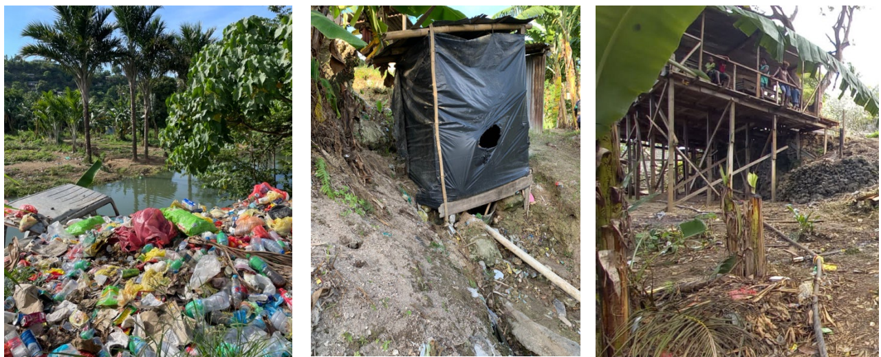
Dumping of waste, pit toilets, and poor-quality housing affect Koa Hill informal settlement

Other community issues include a lack of road access and safe footpaths, lower-quality housing, poor waste sanitation, and overcrowding. There is no sewerage infrastructure or rubbish collection services (a consequence of limited road access), with pit toilets constructed out of locally found materials on a per-household basis; leading to heavy pollution of the Mataniko River.