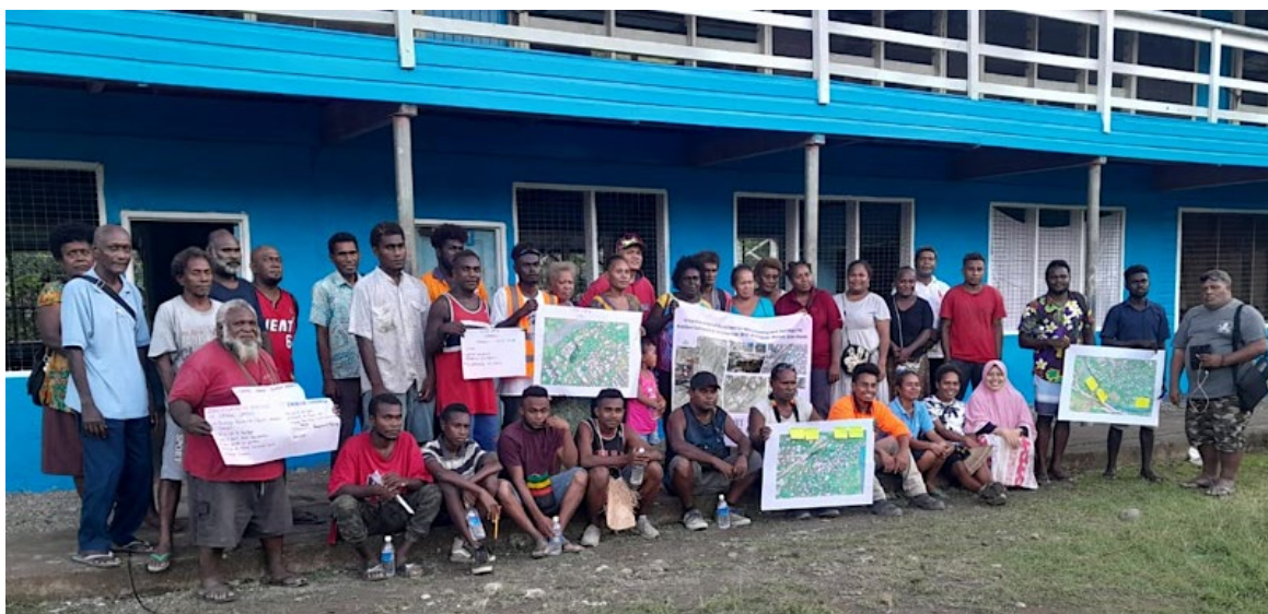
Koa Hill community workshop participants