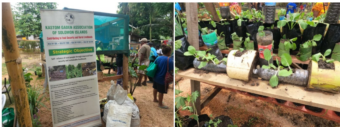
Community exhibition (December 2022)