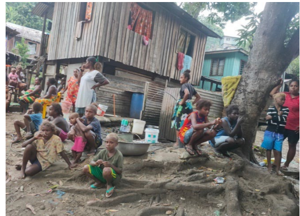
On-site awareness raising meetings

Local community participants gave their observations and advice on design, preferred siting of the pilot NbS and urban garden (and ongoing management), issues that might provoke potential social conflicts, as well as expressing interest in learning more about NbS.