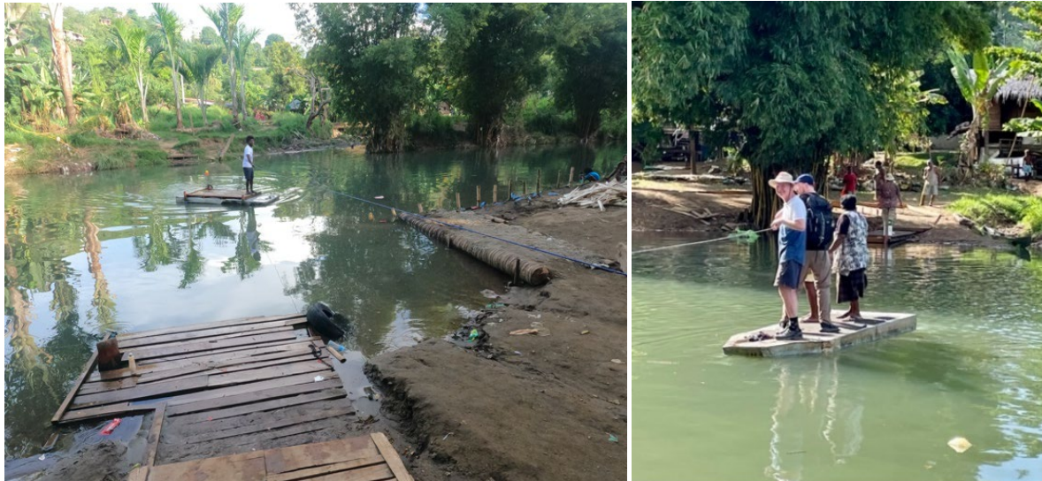
Community-constructed 'floaters' for crossing the Mataniko river

Koa Hill is close to central Honiara on a steep hillside next to the Mataniko River. It covers an area of 0.17 km 2 and ranges in elevation from around five to 70 metres above sea level. The area's steep topography prevented formal development and subdivision and lacks road access. The main road is on a steep ridgeline to the southeast, inaccessible to the communities of Koa Hill except by crossing the Mataniko river on community-constructed floating punts.