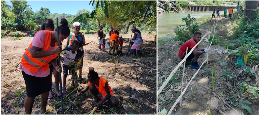
Vetiver grass planting, bamboo replanting and fencing installation on riverbank