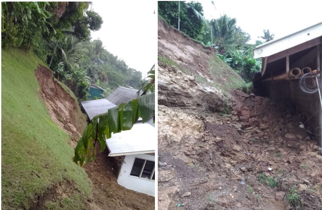
Landslide in Zone 27 following a heavy rainfall event on 11 Nov

On 11 November 2022, following a heavy rainfall event in Honiara, a landslide occurred in Zone 27 near the Southern Seas Evangelical Church (SSEC - close to the concrete stairway, Jacob's Ladder 3). Then on 22 November 2022 a powerful magnitude 7.0 earthquake was recorded offshore from Honiara, followed by a second quake of magnitude 6.0 thirty minutes later. Widespread power outages were reported though there was no major damage to infrastructure and no fatalities. The earthquake and previous landslide in Zone 27 necessitated a change in the planned NbS pilot project activities on 23 November, as the team could not conduct any interventions on the cliff base due to cliff instability.