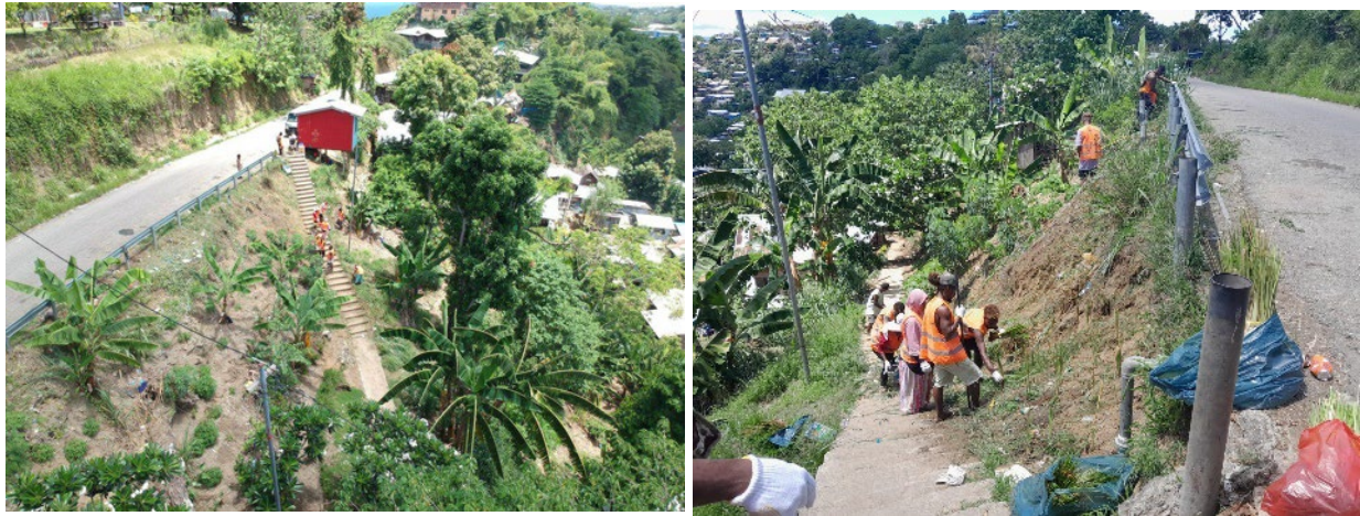
Clearing the track along Jacob's Ladder prior to planting vetiver grass to channel road runoff