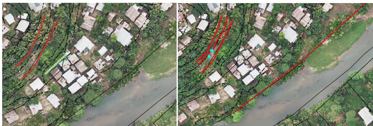
Original pilot site (l). Revised site following landslide and earthquake in Zone 27 (r).

The PacSol-SINU implementation team decided to focus on the upper slope by planting 250 slips of vetiver grass in a pattern that would redirect water from the public bath and leaking pipes into a proper drainage channel to reduce water intrusion into the cliff face. An additional 120 metres of vetiver grass were planted along the downslope riverside track to further reinforce the embankment below the landslide area.