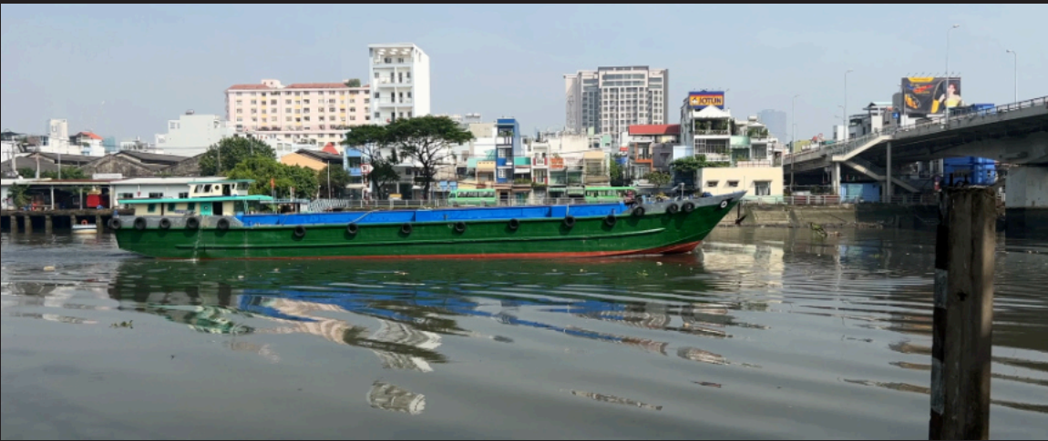
RCN Series: 110