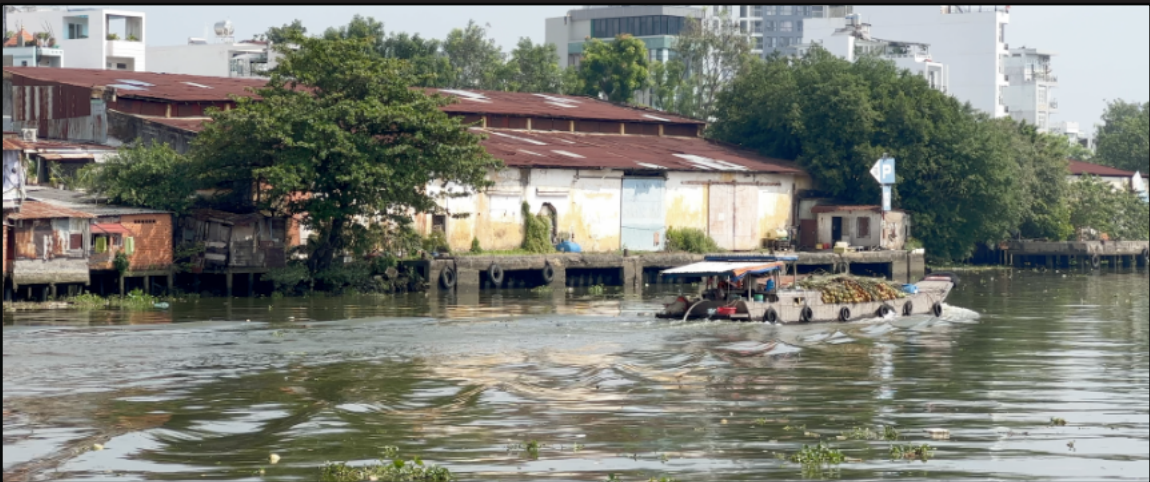
RCN Series: 213