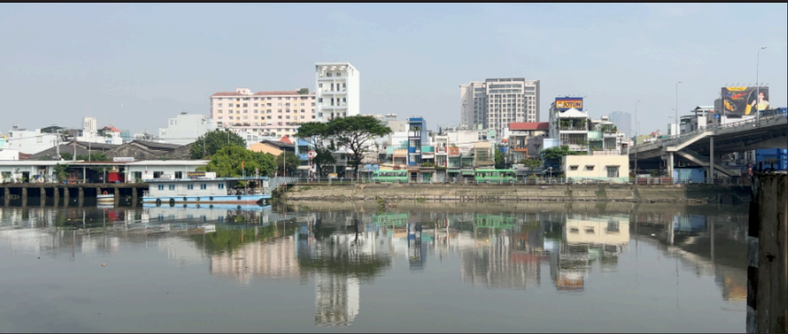
RCN Series: 102