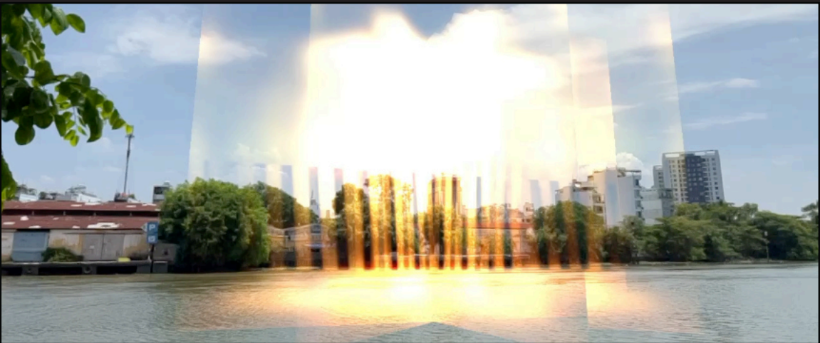
RCN Series: AR 102