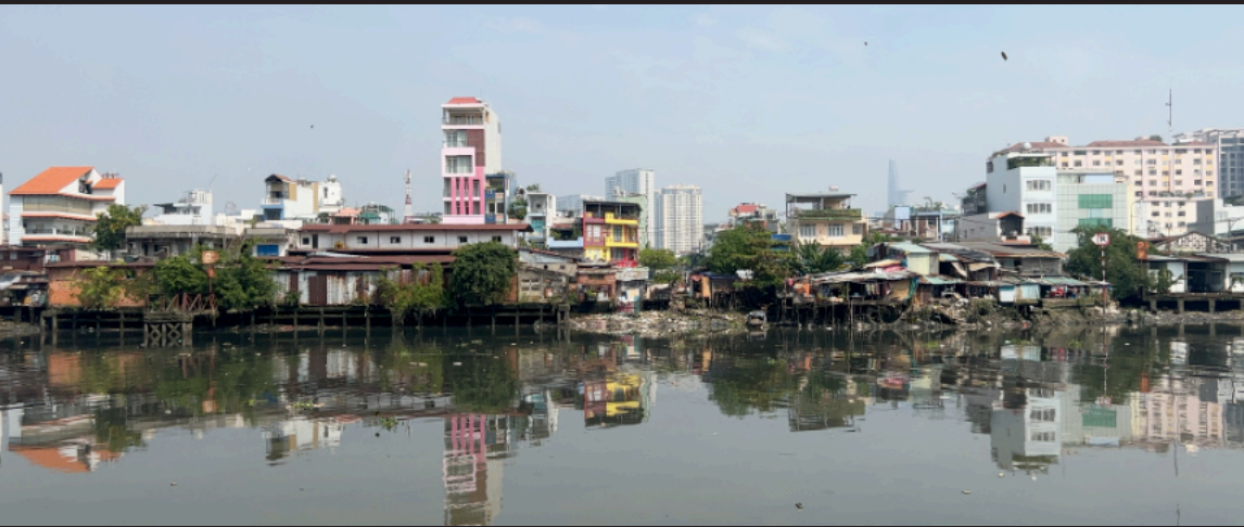
RCN Series: 104

https://doi.org/10.25439/rmt.22673209.v1