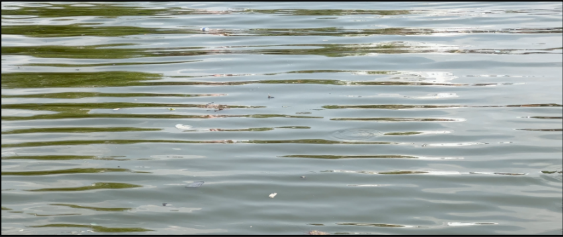
RCN Series: 211