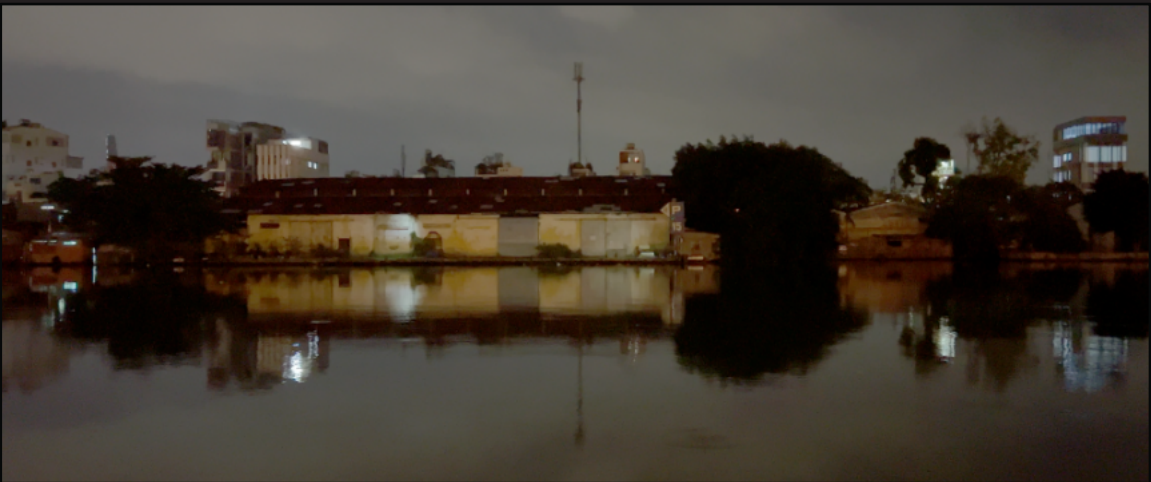
RCN Series: 214

https://doi.org/10.25439/rmt.22737107.v1