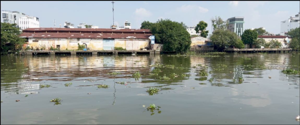
RCN Series: 203