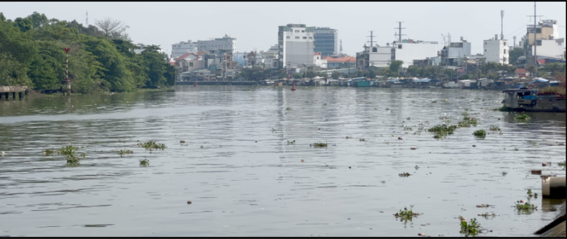
RCN Series: 212