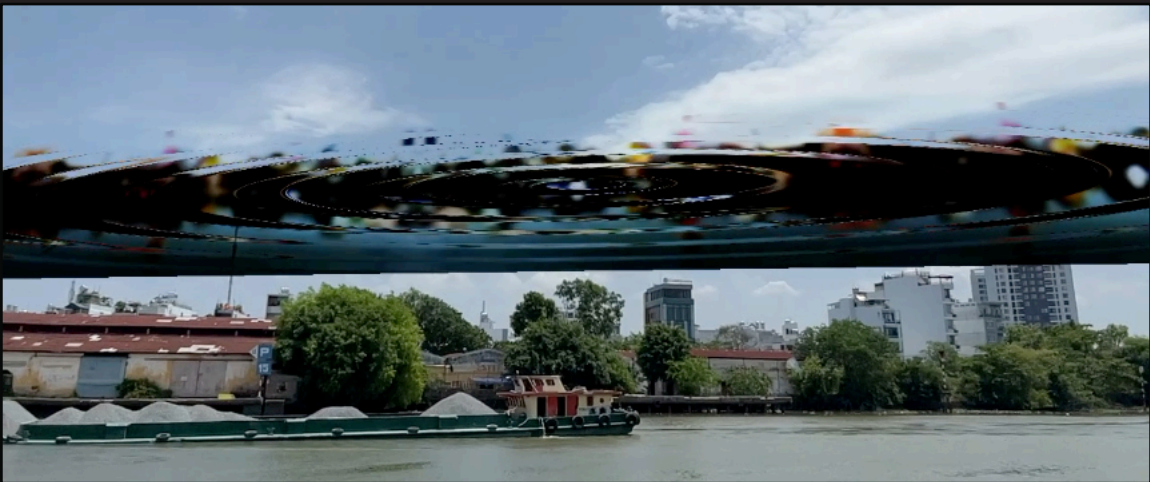
RCN Series: AR 101