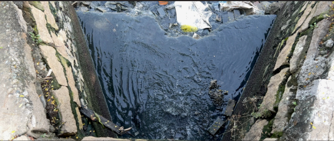
RCN Series: 101