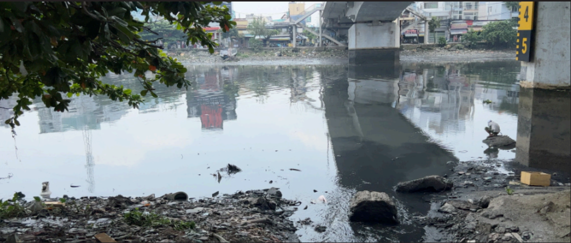
RCN Series: 105

https://doi.org/10.25439/rmt.22673239.v1