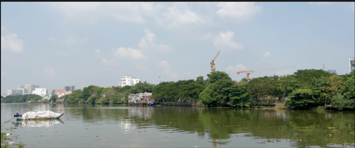
RCN Series: 205