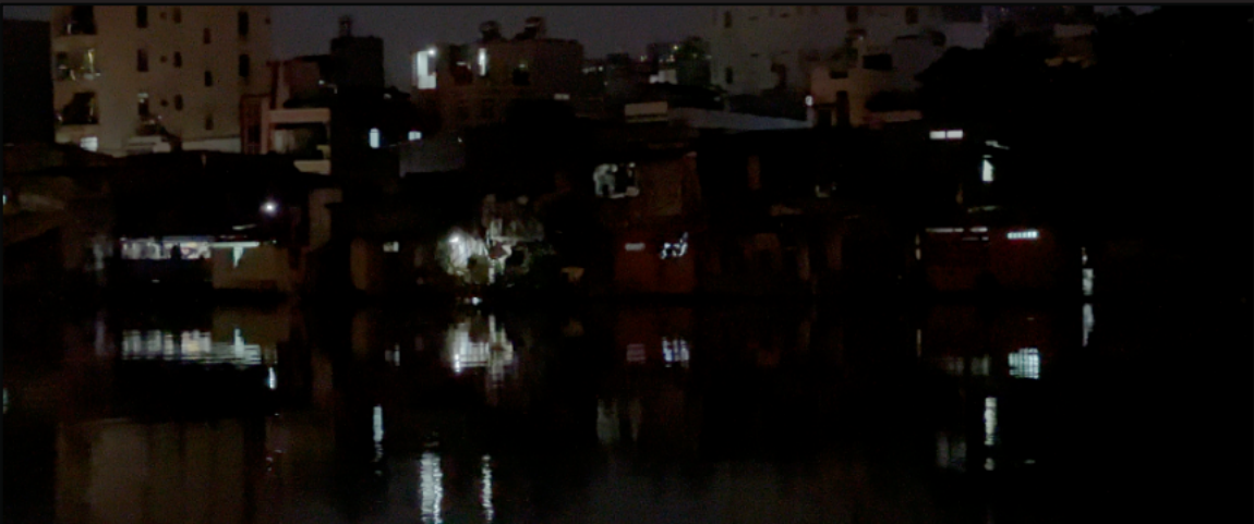
RCN Series: 215

https://doi.org/10.25439/rmt.22769597.v1