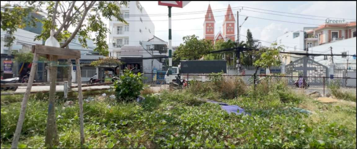
RCN Series: 204