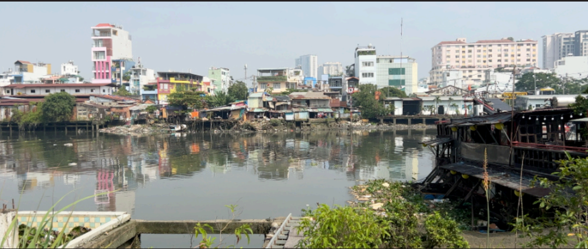
RCN Series: 103