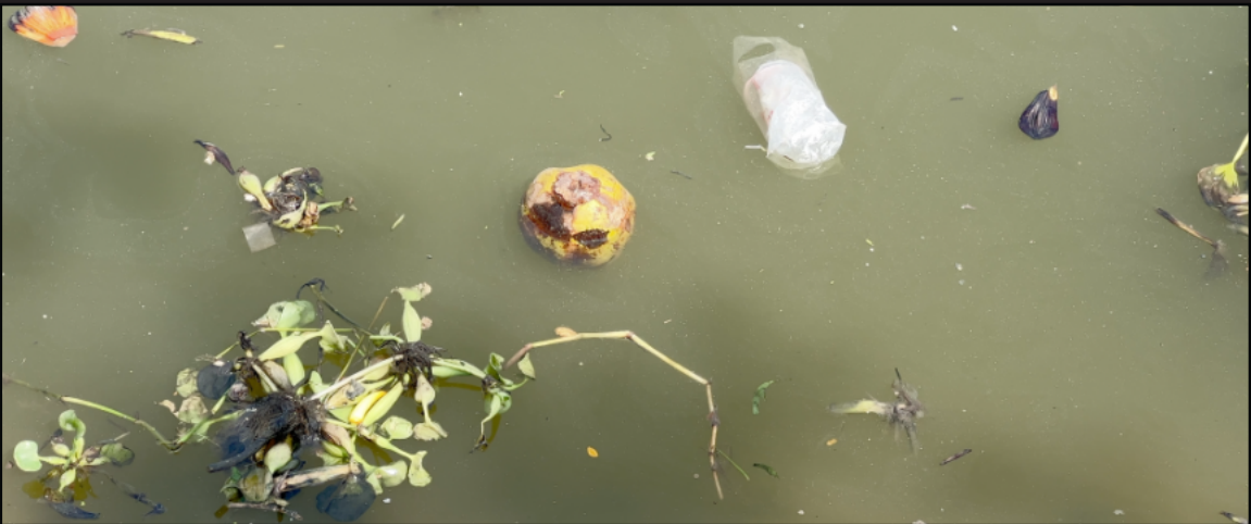
RCN Series: 206