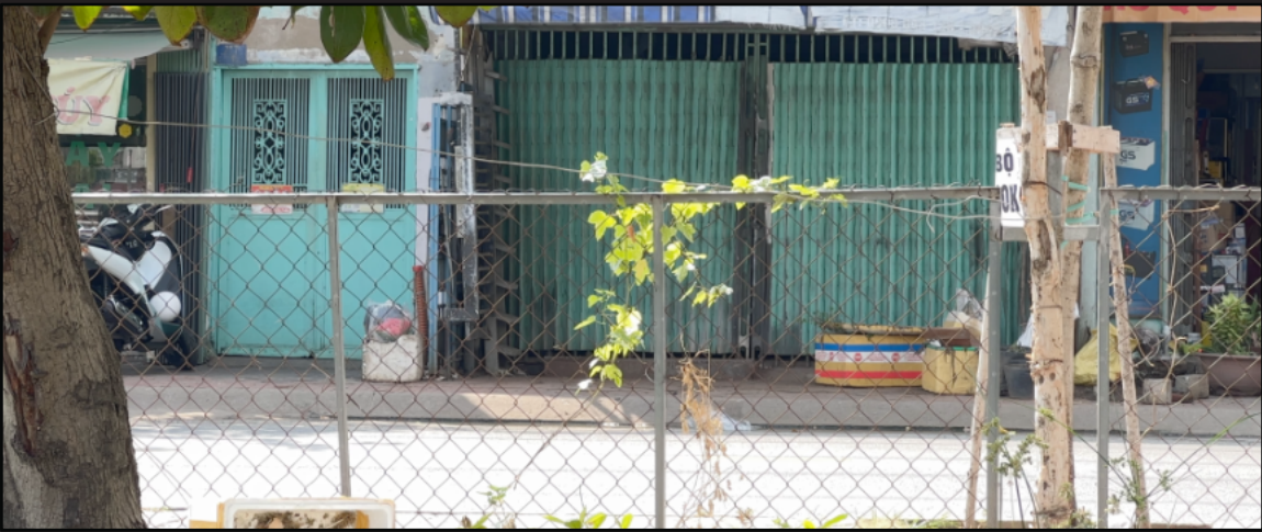
RCN Series: 209