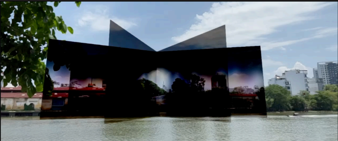
RCN Series: AR 103