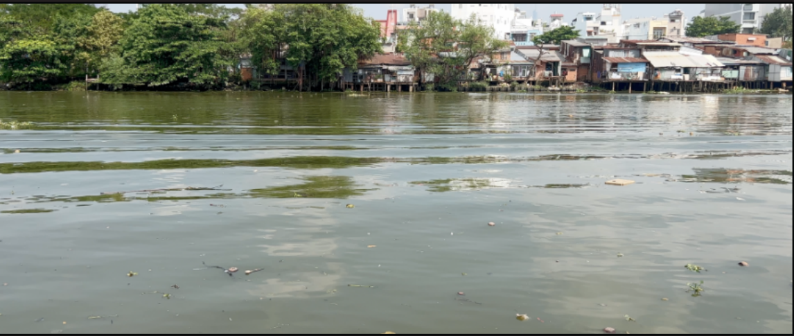
RCN Series: 210