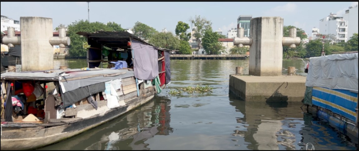
RCN Series: 202