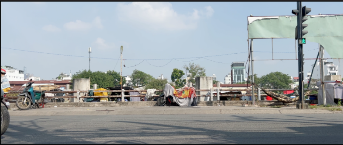
RCN Series: 201