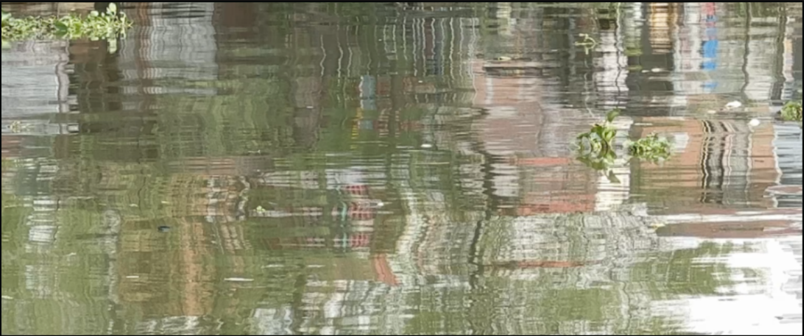
RCN Series: 208