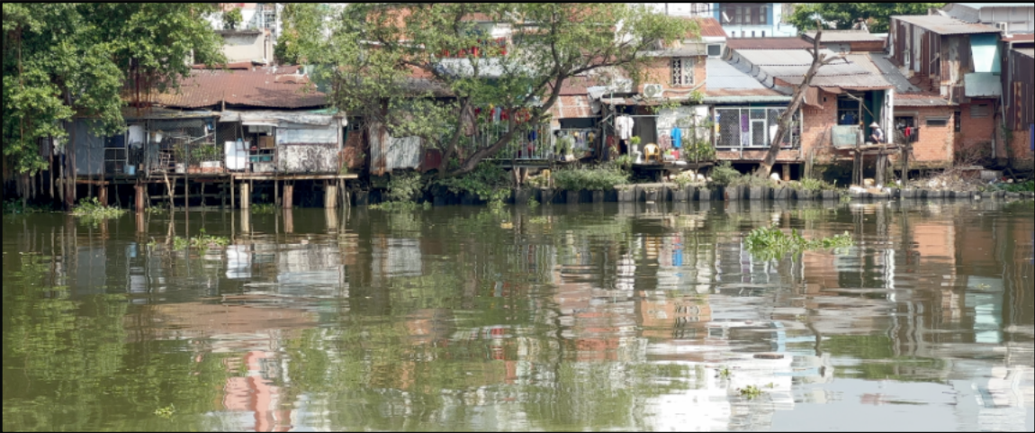
RCN Series: 207